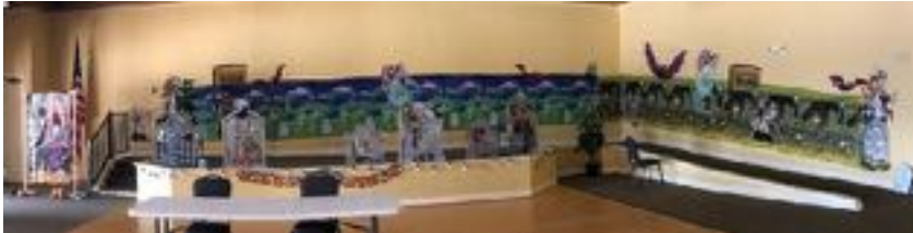
Halloween Dance Decorations

A number of social events have taken place in MOSN over the last few months. We have not been able to attend each event, we but do have a few photos submitted for inclusion in the newsletter. A thank you to those who have provided photos and all of you are encouraged to do likewise.