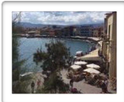
The Kelly's in Greece