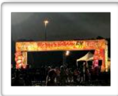
Disney Wine & Dine 5k