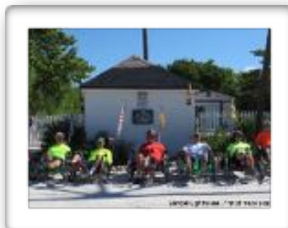
MOSN cyclists on tour