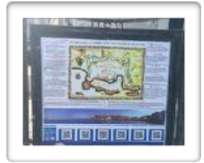
The Kelly's in Croatia