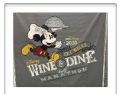
Disney Wine & Dine