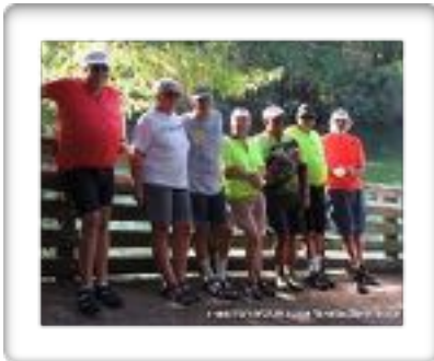
MOSN cyclists on tour